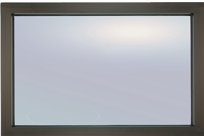
Rhino model 5500 fixed window was used in the Oread project

Our mission is to manufacture high quality window and door products that are value priced, thermally efficient and low maintenance. Throughout our history we have established ourselves as an innovator in the design and manufacturing capability of insulated windows and doors. Stringent product testing and innovative design has allowed our products to evolve as market and consumer needs change, bringing you the quality, maintenance-free products you desire. We also publish our AAMA test results to back up our claims of product performance and quality.