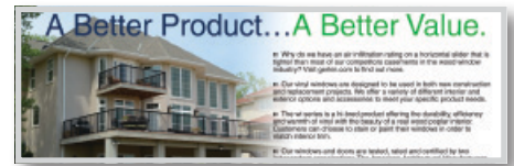
Dual Graphic Information Panels

The new vinyl single window display by Gerkin is designed to increase sales and product offering to your customers and will compliment any showroom or lumberyard. Designed with portability in mind, the single window display comes with heavy-duty wheels and a tilt handle for easy maneuverability. The display includes a two-sided header graphic, a brochure holder and dual graphics on each side of the display featuring comfort series benefits. Display dimensions are 42"W x 21"D x 72"H and any Gerkin Comfort Series® vinyl window can be ordered for your particular needs. The display price is $600.00 – ask your Gerkin Sales Representative about available rebate options.